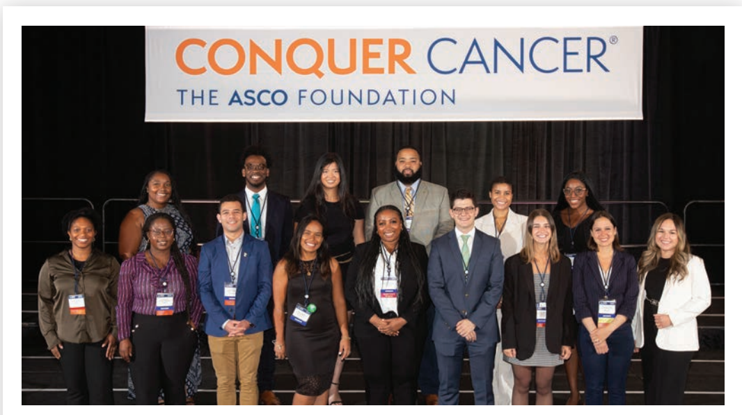
2021 MSR Recipients at the 2022 Grants & Awards Ceremony and Reception.